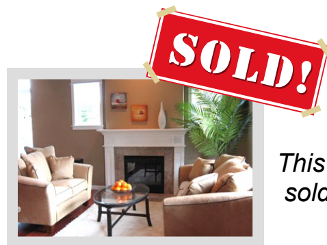
This staged home sold in one week!